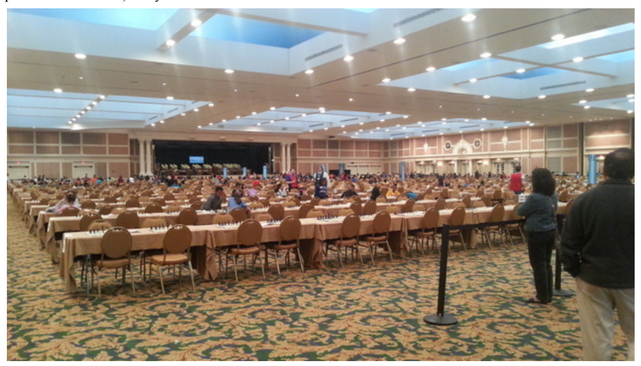
This is the hall where parents anxiously waited.

This is one of several halls where tournament games were being played. There were 5335 participants (not including parents and coaches) this year and a new record was set.